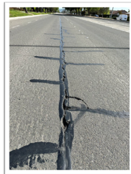
Corral Hollow Rd