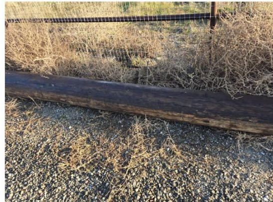
Figure 6. This is such dry land, and PG&E agreed to overhead high power transmission. How and why this happened is a concern.

We request the city to : stop and investigate.