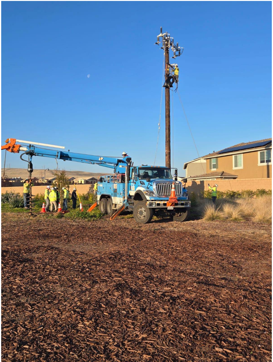
Figure 2. The poles were erected on the Parklin Community side. The poles were erected on the CLOSED Emergency Access Road, which has dry grass and is prone to fire. Greenwood homes are under construction and the power lines are underground.

We would also like to note that PG&E highly recommends underground transmission, so adding new installations which are overhead, when it is possible to make this underground, contradicts all established current standards, and lacks common sense. Specifically on January 8, 2025, PG&E CEO, Patti Poppe noted: