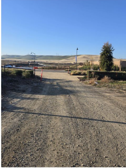
Figure 3 . The road we see here is Tracy Hills Drive. The pole currently installed (the first one) is on the right hand side of this picture. Across the road (Tracy Hills Drive), all the cabling is underground, as per the PG&E crew.