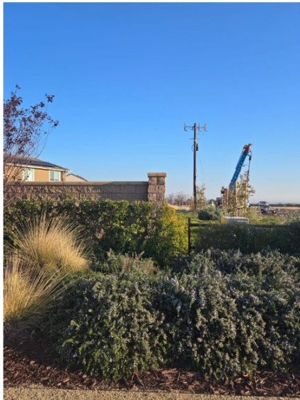
Figure 5. Crews installing pole, very close to homes