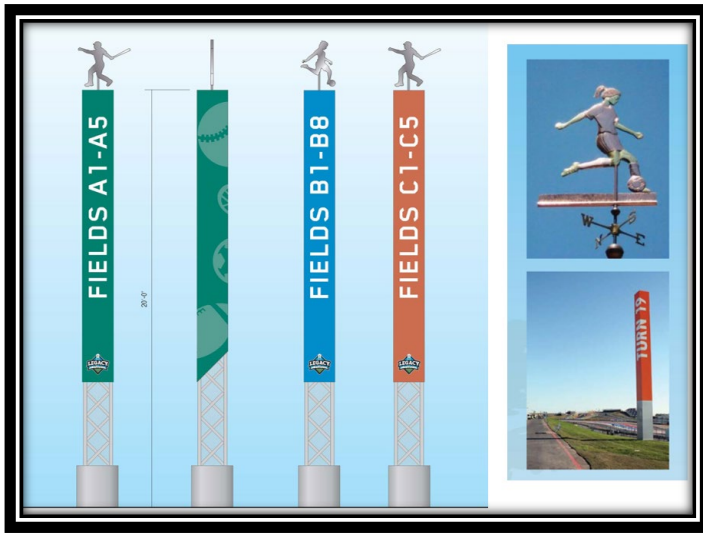
Field Identification Markers